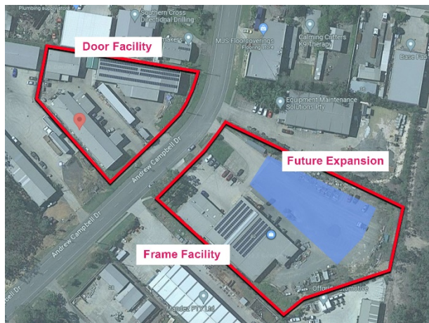
Birds eye view of AAFD manufacturing site layout

With nearly 3 acres of manufacturing under roof, we have the best people and facilities.